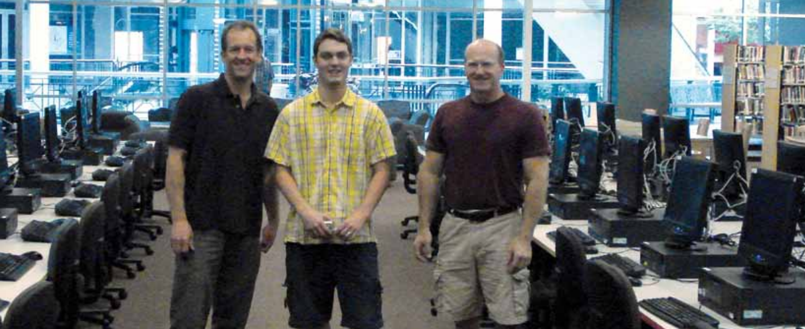
The Library's small but mighty IT team (just 8 members!) not only supports the operation of the entire collection management system - including circulation, the catalogue and the member database - but also more than 700 public and staff workstations in LPL's 16 locations.